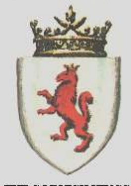
THE CORNISH KINGS

The source for these is the Tudor Atlas of 1611 compiled and illustrated by John Speed. Original spellings are maintained.